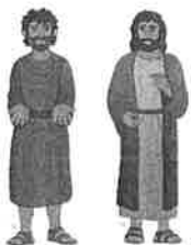
Figures 13, 23, and 28 (Jesus)