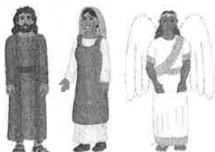
Figures 4, 10, and 27